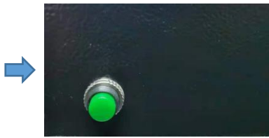
④Press the escape key to set or change the password