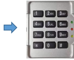
⑤The yellow light is on for a long time,input 3~8 digit password and Press"#(B)"to confrm