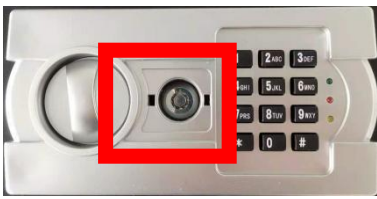
①Open the emergency key cover