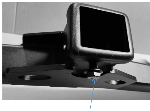
M10*15 hexagon nut with flange