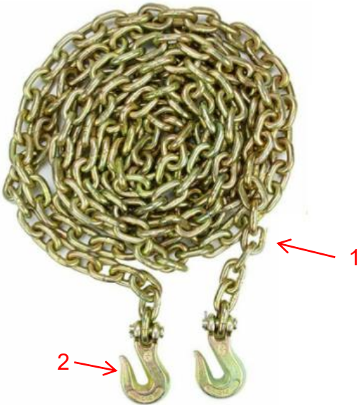
1. Chain 2. Hook