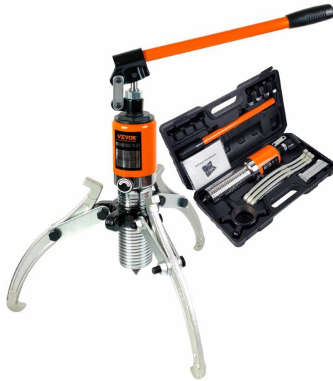
Figure of the Product